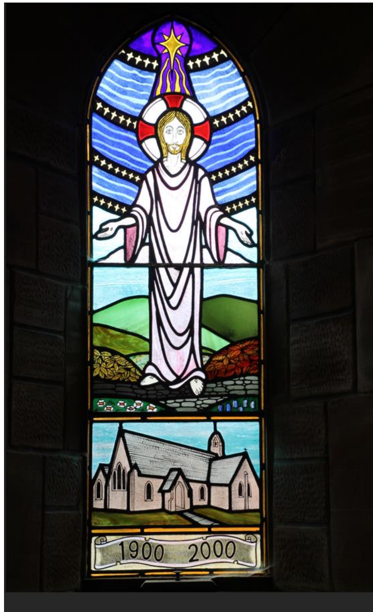
Our Centenary Window