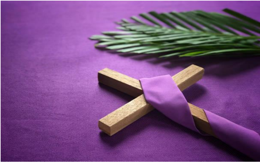
Lenten Cross: March 2021

To submit an item for Prospect please email Lorraine on sessionclerk2020@gmail.com