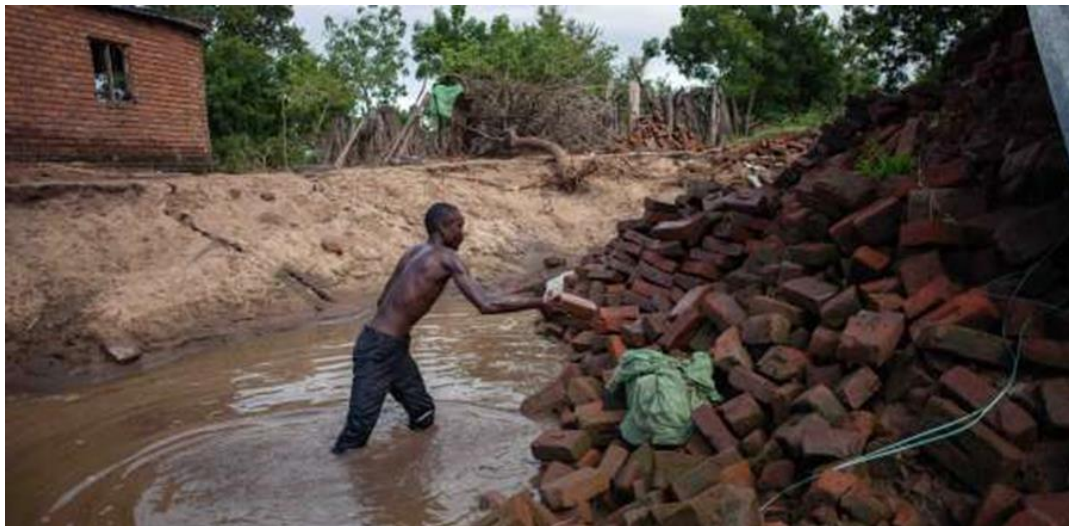
The effect of cyclone Freddy in Malawi

Donations will go to supporting families in Malawi to overcome the devastating effects of cyclone Freddy, which flooded many crops. Alongside this the cost of fuel, fertiliser, food and school fees has greatly increased making it more difficult to be self-sustainable farmers in a country impacted so significantly by climate change increasing both droughts and floods. There will be daily devotional booklets to take home on the table too for those that want to spend time in more focussed prayer for individuals affected.