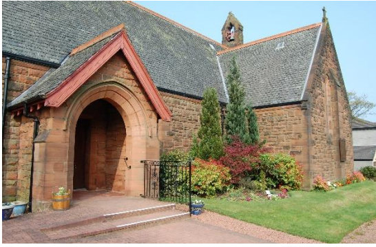
Stepps Parish Church

In this edition there is our usual features with updates from LHM as well as congregational news. -----