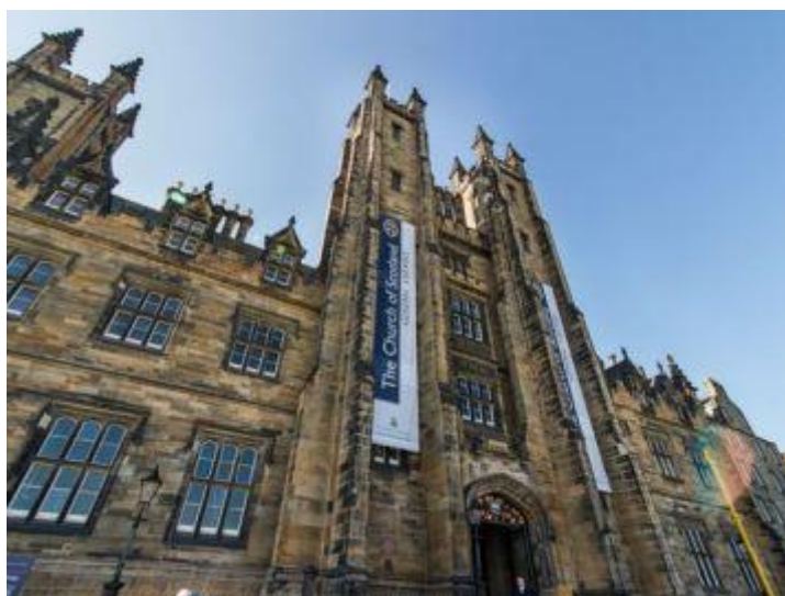
Assembly Hall in Edinburgh

The 2022 General Assembly of the Church of Scotland will be a hybrid event, with a mixture of in-person and online commissioners.