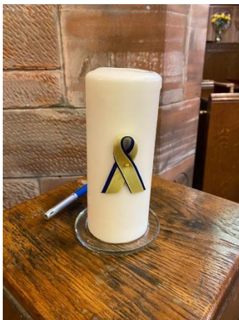
Candle for Ukraine

If eligible, please also complete the Gift Aid Declaration form by following this link to the HMRC gift aid form , ensuring the Charity Name is completed as "The Church of Scotland". The completed form can be returned to the Church of Scotland by email to sfadmin@churchofscotland.org.uk . Alternatively a cheque can be sent payable to The Church of Scotland with an accompanying letter and completed gift aid form.