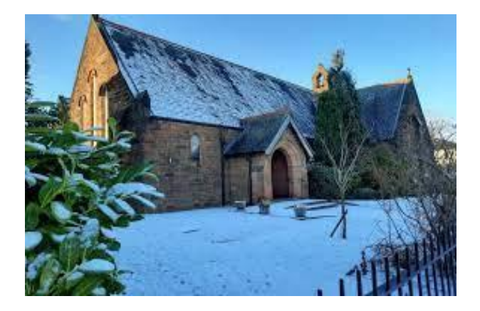
Winter morning at Stepps Parish Church