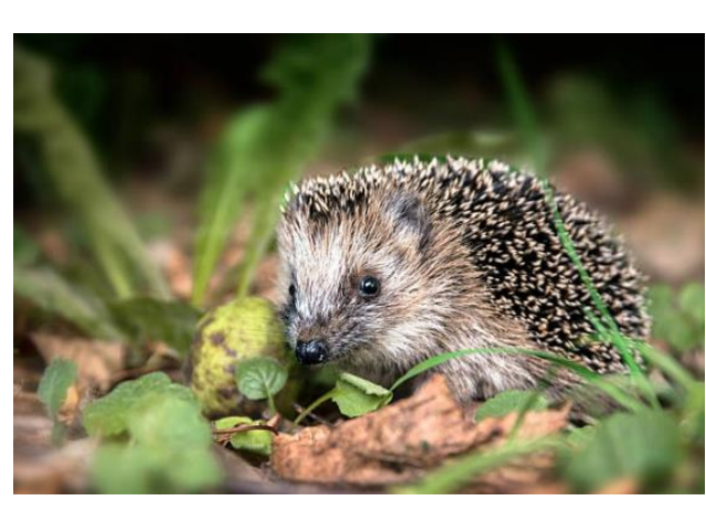
A Hedgehog in the grass.