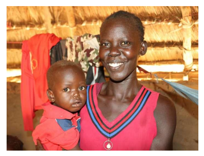
Yokwe with her youngest Child

The climate crisis in South Sudan is polluting fragile water sources, killing crops and destroying homes. Combined with years of conflict and the Covid-19 pandemic, it's forcing mums to make impossible choices for their children. Dirty water, or none at all? A morsel of food each, or a bigger portion for one? School fees, or materials to rebuild the family home?