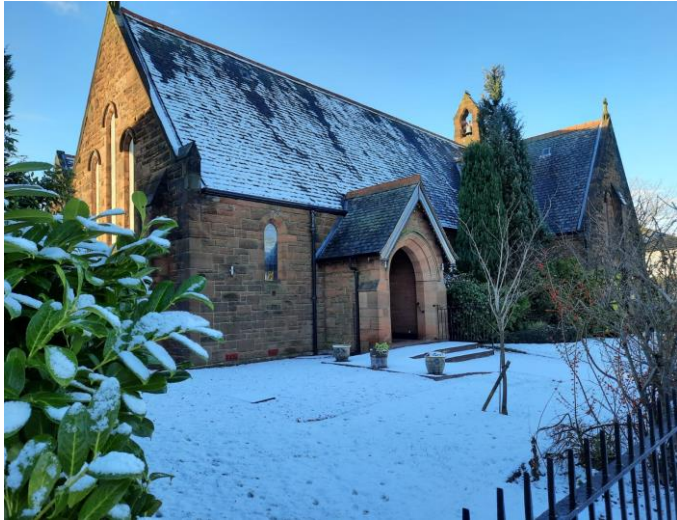
A winters morning at Stepps Parish Church

In this edition there is all of our usual features with updates from the Boys Brigade, LHM, Friendship Club and updates on our Christmas Collection.