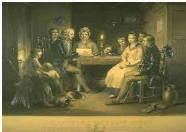
A Cotters Saturday Night

“From Scenes like these, auld Scotia’s grandeur springs, that makes her loved at home, revered abroad.”