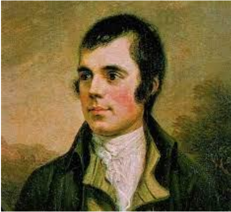
Painting of Robert Burns