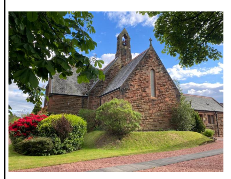
The Church gardens looking towards the Vestry

Prospect Magazine will be taking a break over the Summer until the beginning of September and during this time it's contributors will be taking a break.