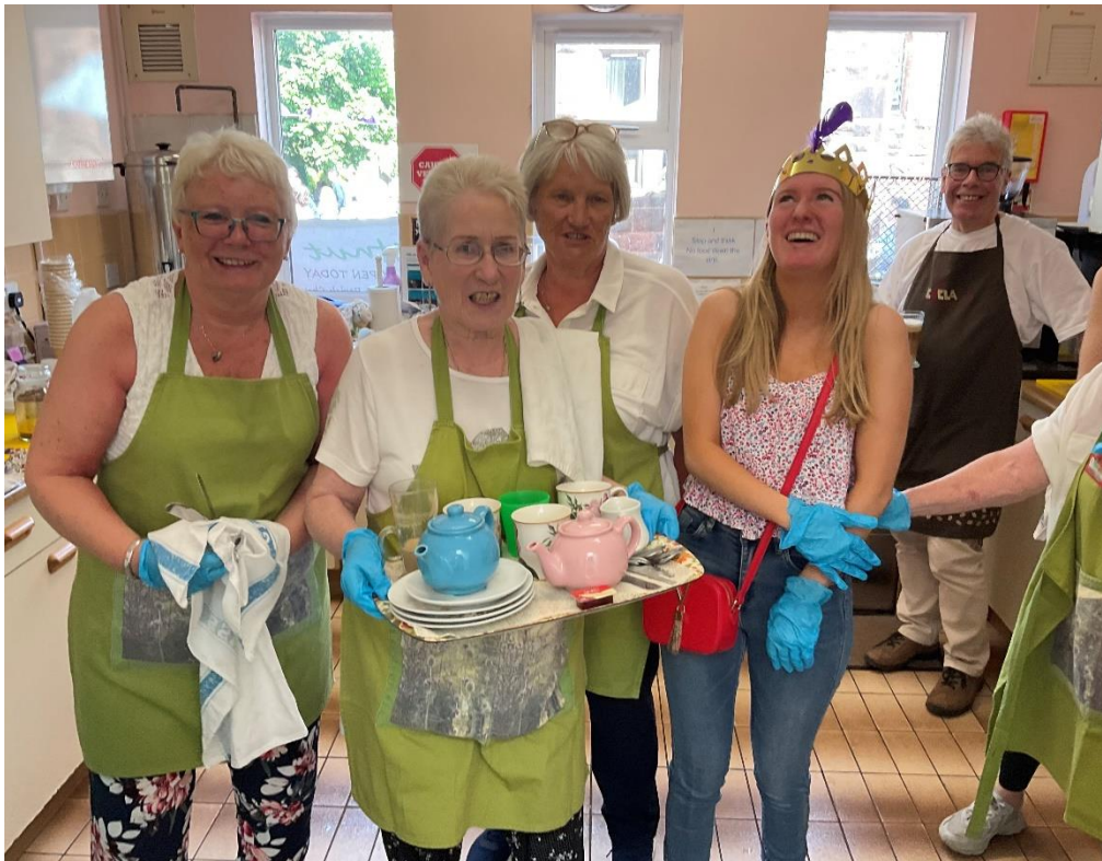
Some of our Heroic Chestnut Cafe Team Volunteers

It shows the great community spirit that Stepps, Cardowan and Millerston has with over 390 people attending the afternoon.