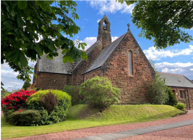
The Church gardens looking towards the Vestry