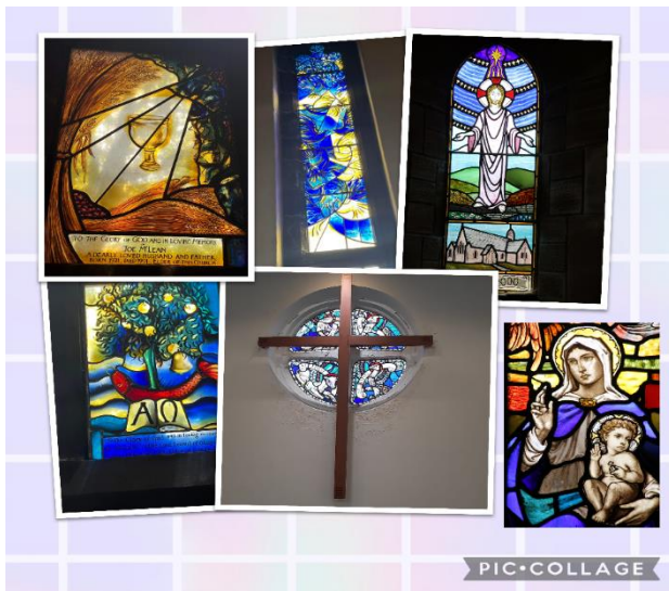
Stained Glass Splendour using some from of our Cluster churches beautiful windows.

The second of our cluster meetings was held in the sanctuary on Monday the 27 th of June. Representatives from all five congregations came together to continue to explore our common mission goals for the future in preparing our Mission Plan, required to be forwarded to Presbytery by the end of July. An initial ice breaker allowed everyone to introduce themselves, thereafter each church shared some of their successes and hopes for the future. A strong common desire was voiced about the importance of retaining a local church identity within each parish while recognising that a coming together in shared worship was needed to strengthen a sense of working collaboratively as a wider church