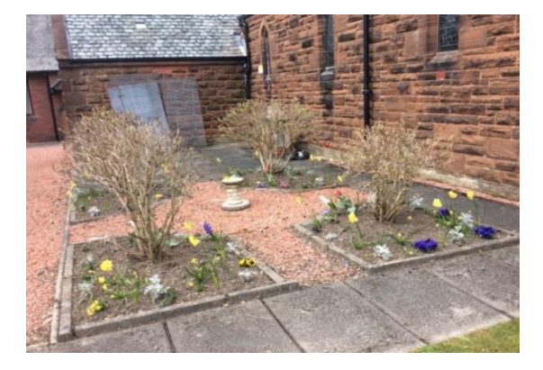
Sunday Club Garden in Bloom