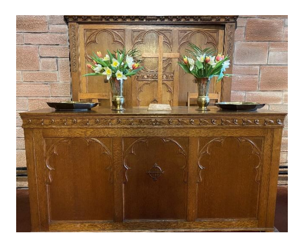
Flower Arrangment Chancel Area

Please contact me on 0141 779 4056 or email me at magsc50@sky.com