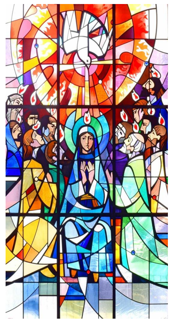
And the Holy Spirit descended on him like a dove. You are my beloved Son; with you I am well pleased Luke 3:22