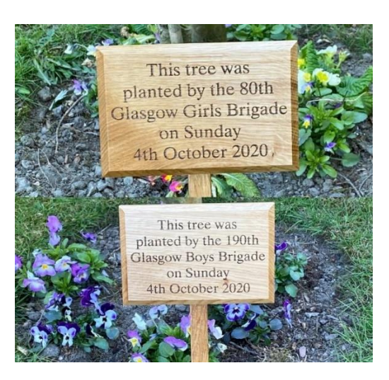
Tree's planted by our Organistions