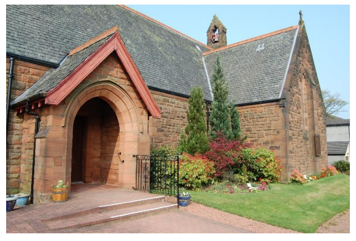
Stepps Parish Church May 2021