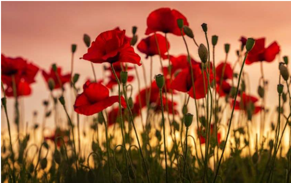
A field of Poppies

In this edition there is all our usual features with updates from the Boys Brigade, LHM as well as our congregational news and an update on the Presbytery Planning process.