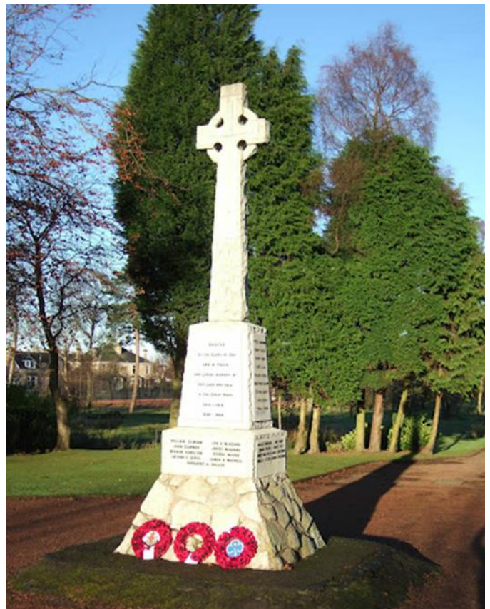
Stepps War Memorial

Remembrance Sunday is a time for us all as a nation to acknowledge corporately the sacrifice of those who have gone before us this year into God's hands, whether national figures, such as The Queen, or our own loved ones; people who were important figures in our civic, military and private lives. This time allows us to focus on those whom we miss most, while at the same time saluting those who gave their lives serving our country in the cause of the freedom we enjoy. Join us on Sunday 13 th November at the Stepps War memorial Bluebell Park @ 10.50 am.