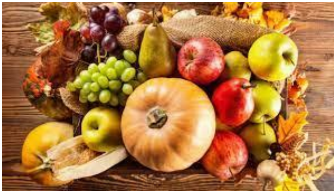
The Joy of Harvest Thanksgiving

In this edition there is all our usual features with updates from the Boys Brigade, LHM as well as our congregational news.