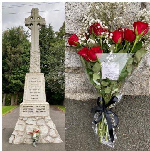
Stepps War Memorial

At Stepps Parish Church in Glasgow, the flowers from the morning service were laid at the local war memorial.