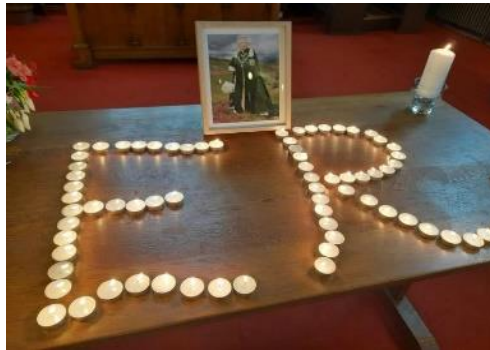
St. Margaret's Church

CHURCHES across Scotland have mourned the death of Her Majesty Queen Elizabeth II and taken part in the accession of King Charles III.